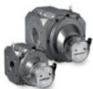
Principio di funzionamento