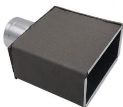
Attacco posteriore Rear connection